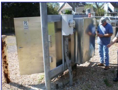
Pump Station #223, located at the intersection of Don Budge Avenue and Backcourt Drive, will be replaced.