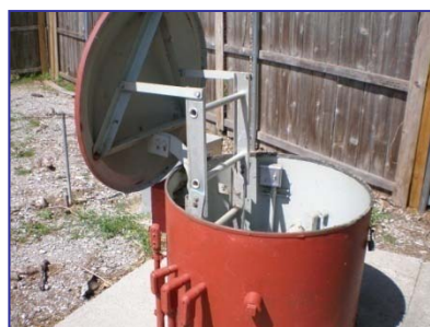
Pump Station #327, located at the intersection of Alder Drive and Crepe Myrtle Drive, will be replaced.